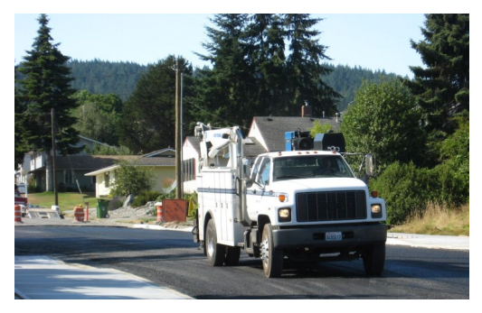
Officially Completed July 9, 2009