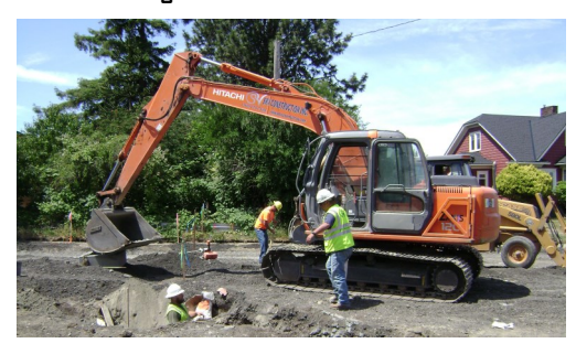
Contract Value: $1,288,921